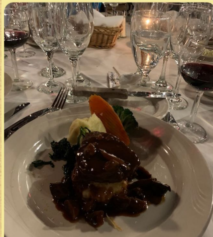
Inside Out Beef Wellington