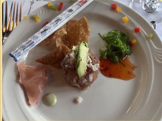
Ahi Tuna Tartare Maryland Crab & Avocado Tower