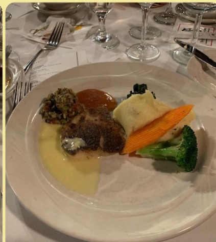
Porcini Dusted Fillet of Sea Bass