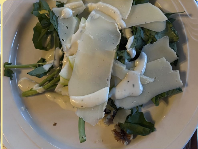
Julienne Endive & Watercress Salad