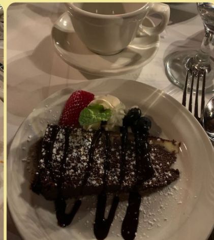
Flourless Swiss Chocolate Almond Torte