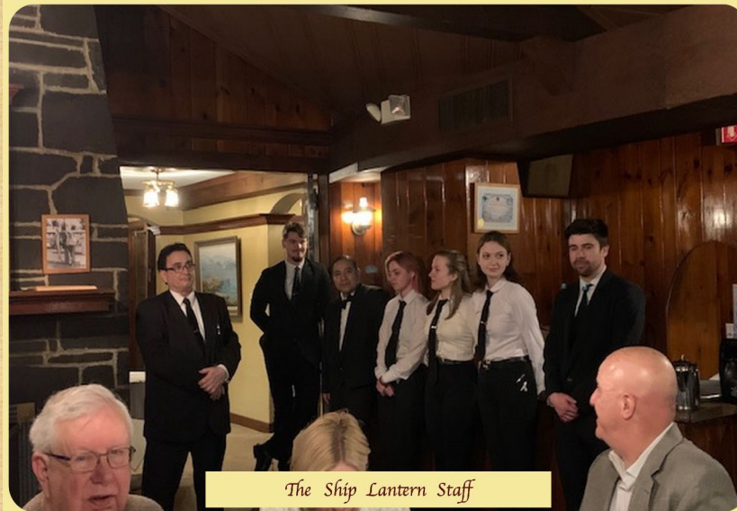
The Ship Lantern Staff