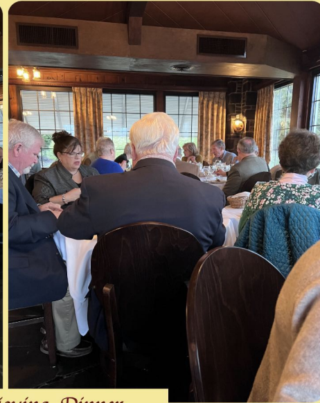
Members enjoying Dinner